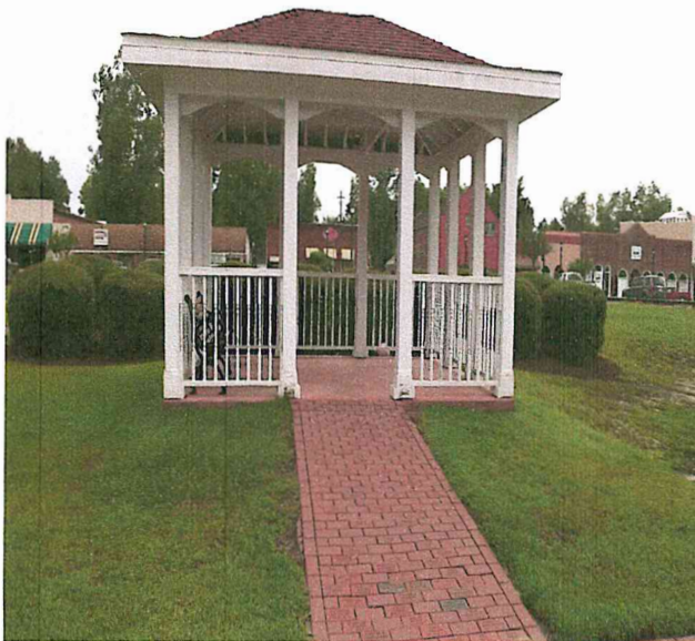
Memorial Brick walk to the Gazebo