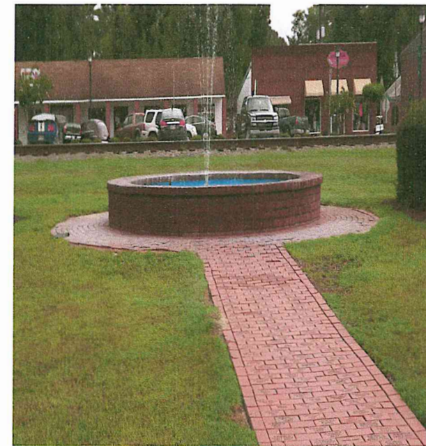
Memorial Brick Walk to and around the fountain. Former city employee memorial bricks are located around the fountain

The Memorial Park and Walk is located between Highway 280 and Railroad Street in the heart of Pembroke's Downtown. Over the past few years, several memorial benches, purchased in honor or memory of outstanding citizens, have been placed under the century old oak canopy. A Mayor's engraved walk has been established to honor past mayors, for family and friends to enjoy. In addition, an engraved Memorial Walkway, paved with bricks purchased by community members "In Honor of" or "In Memory of" their families, loved ones, and friends, have been placed leading to the fountain and gazebo.