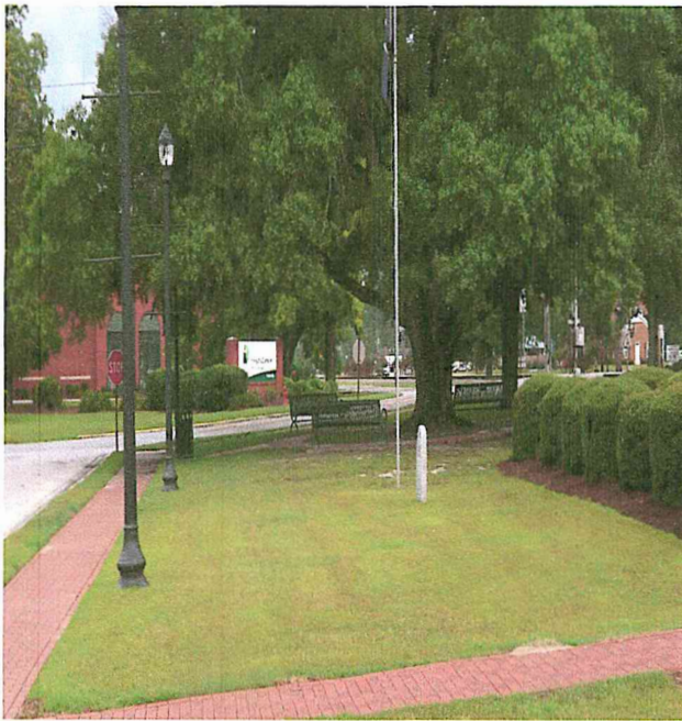
View of Memorial Walk to and around the Oak tree canopy with Memorial Benches.